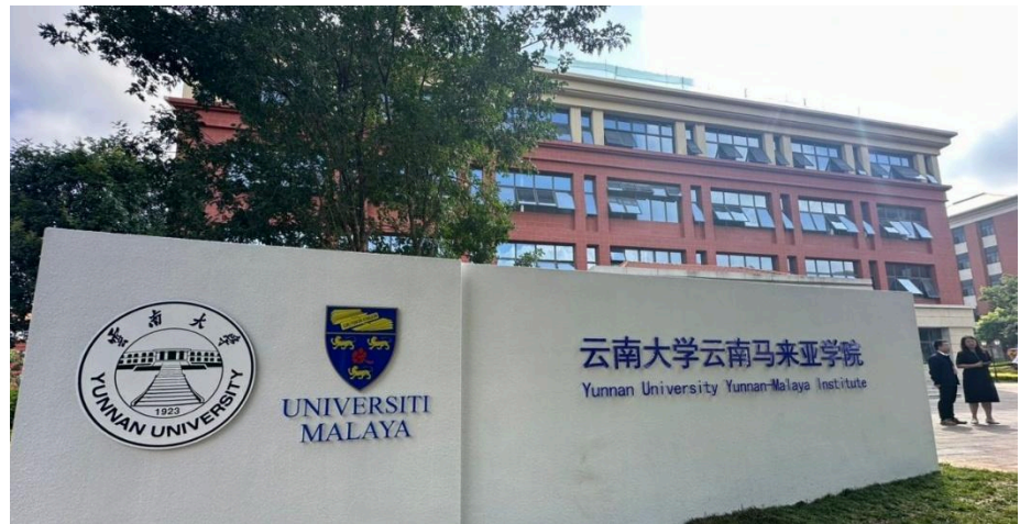
One of three newly-constructed buildings that make up the Yunnan-Malaya Institute.